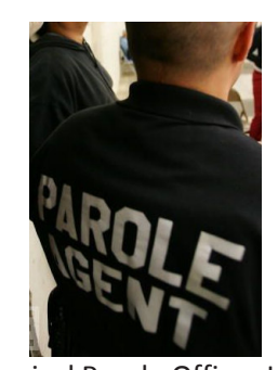
A typical Parole Officer Uniform

"P&P officers look just like other people. They can be men or women. They are like police officers except that they don't wear uniforms. They have badges and sometimes they carry guns. A P&P officer might come to your home sometimes to make sure your family member is following the rules. If you are afraid or don't feel safe with your family member, you can tell the P&P officer and (s)he will help you."