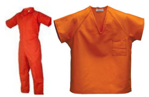
Examples of typical inmate clothing

"Inmates wear identical uniforms that look like doctor or nurse "scrubs." They also have socks and shoes, provided by the prison."