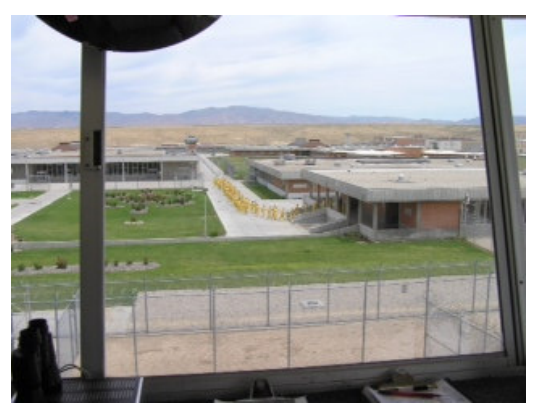
A view from one of the rooms at Tower 1 of Idaho State Correctional Institution