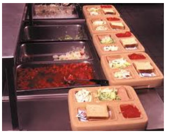
Example of food trays

"The prison serves three meals a day on trays in a cafeteria similar to the one you have at school. Some inmates eat meals in their cells. Inmates can also buy snacks from a prison shop called a commissary."