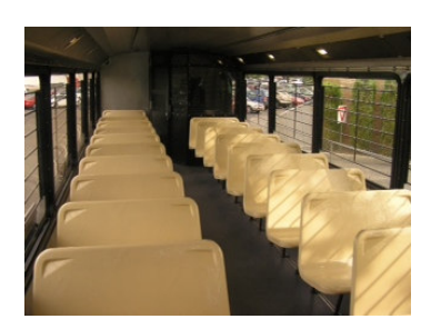
Interior of a bus